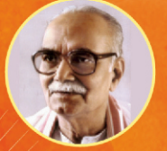
Shri Rajju Bhailya Seva Nayas