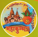
Maha Kumbh Mela 2025