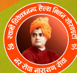
Swami Vivekananda Health Mission Society