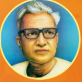
Shri Bhaurao Devras Nayas